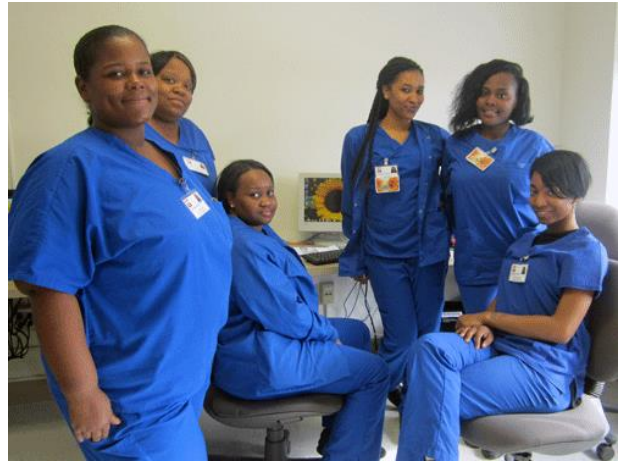
Some of the students in Essential Skills Class