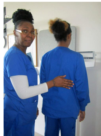
Students practice proper way to weigh a patient