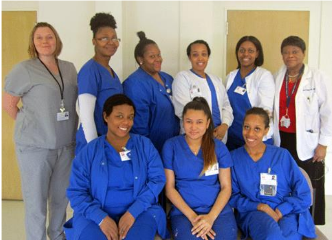
Some of the students and the CNA teachers