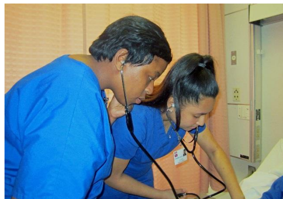
Students practice with their stethoscopes