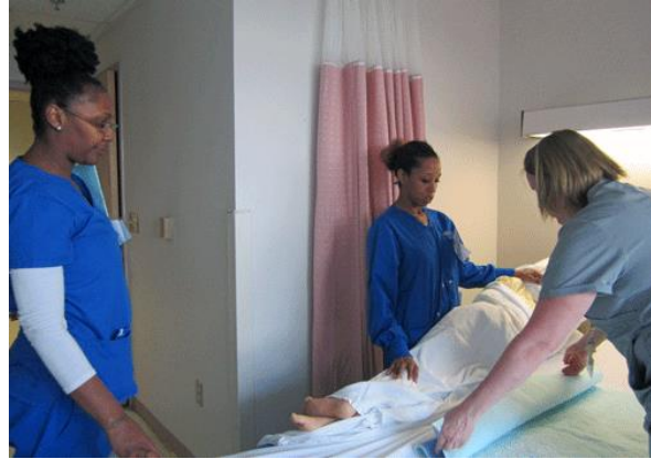
Teacher demonstrates how to make a bed with a patient