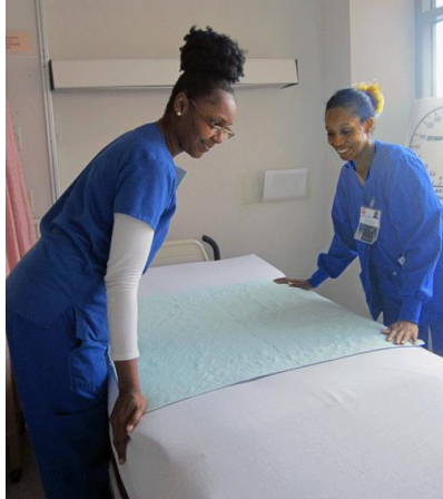
Students learn and practice the proper way to make a bed