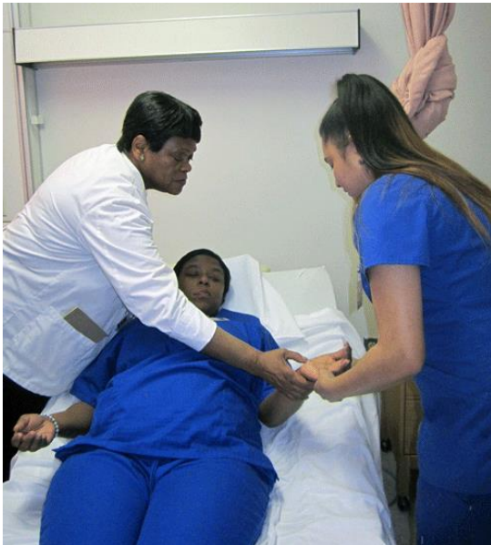
Teacher demonstrates proper way to take a pulse