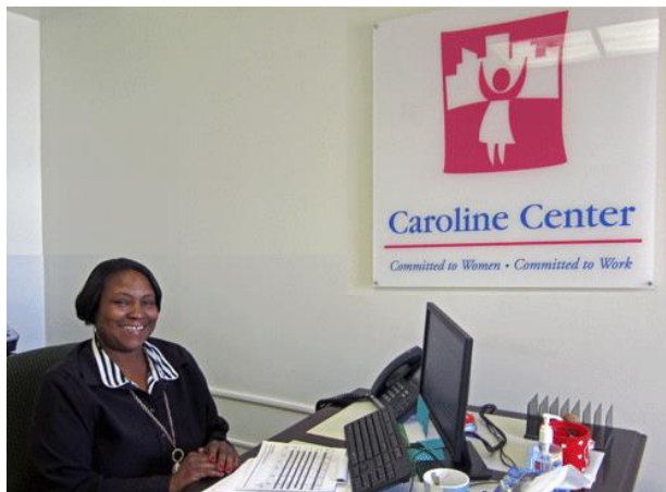
A smiling welcome to all