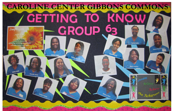
First Group at Caroline Center Gibbons Commons