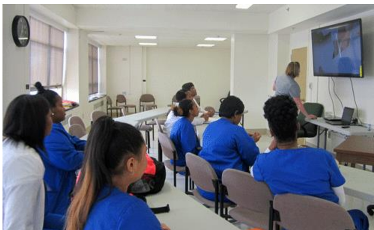
Students in Nursing Assistant Theory Class